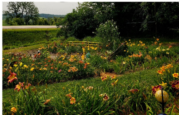
Lett garden by the road with seedlings